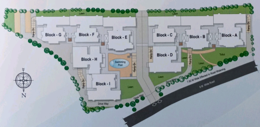
SITE LAYOUT PLAN