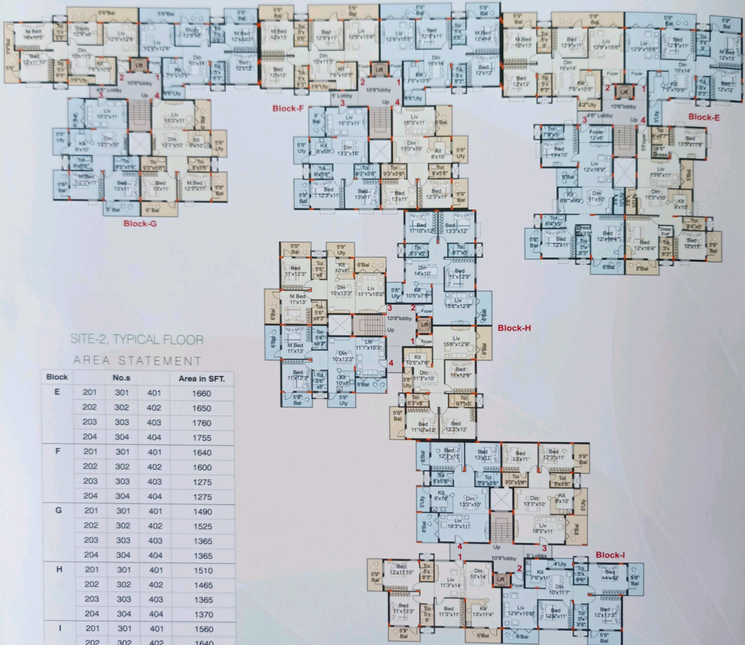
SITE-2, TYPICAL FLOOR AREA STATEMENT